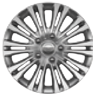
17-INCH PAINTED ALUMINUM Standard on Town & Country Touring-L