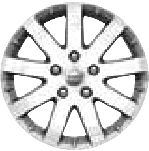
17-INCH ALUMINUM Standard on Town & Country Touring