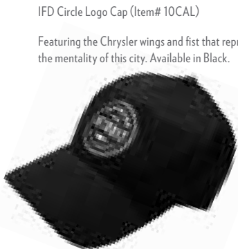
IFD Circle Logo Cap (Item# 10CAL)

Featuring the Chrysler wings and fist that represent the mentality of this city. Available in Black.