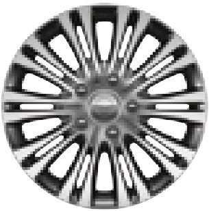
17-INCH ALUMINUM WITH POLISHED FACE AND GLOSS BLACK PAINTED POCKETS Standard on Town & Country S model