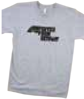
IFD Men's Fist T-Shirt (Item# 10C9T) Featuring the eagle and fist that represent the mentality of this city. Available in Heather Gray.