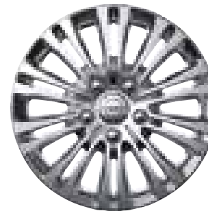
17-INCH POLISHED ALUMINUM Standard on Town & Country Limited