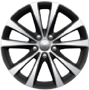
17-INCH* POLISHED/PAINTED ALUMINUM Standard on 30th Anniversary