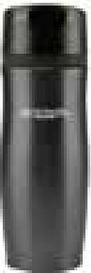
14-oz. Chrysler Vacuum Tumbler (Item# 10ERR) The ultimate laser-engraved titanium tumbler: a refreshing combination of advanced technology and elegant practicality. Available in titanium.

Featuring the Chrysler wings and fist that represent the mentality of this city. Available in Black.